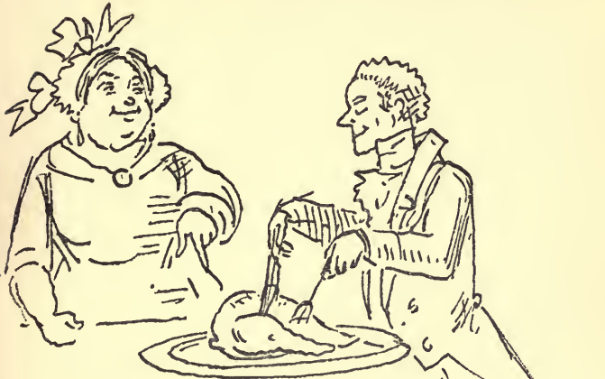
THE CARVER'S LESSON

long before his death. I went with Leech, and the servant told us that he was engaged. As we were going disappointed away, Miss Thackeray opened the